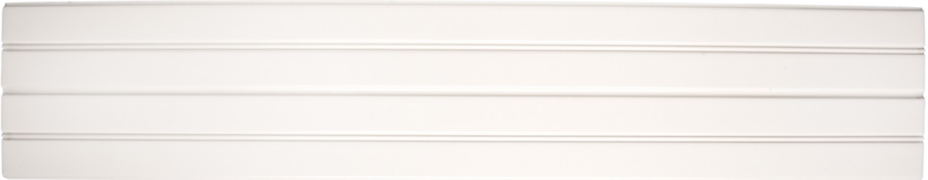
6" X 30" WAINSCOT PLANK† CTDFOW