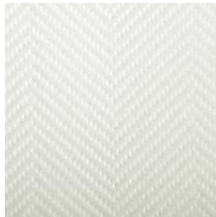
Countil in Shale Glossy V3