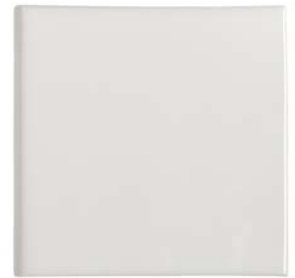
6" X 6" CTF066