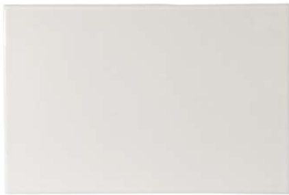
6" X 9" * CTF069