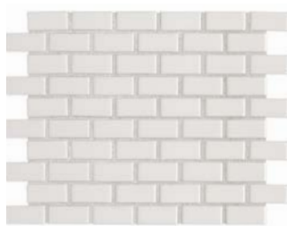
1" X 2" STAGGERED MOSAIC† CTSM12