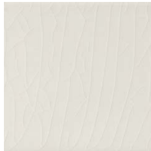
Canvas Glossy Crackle V3