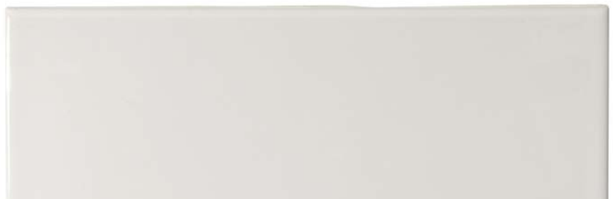
6" X 18" ** CTF618