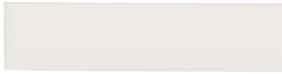
3" X 12" CTF312