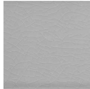
Smog Glossy Crackle V3