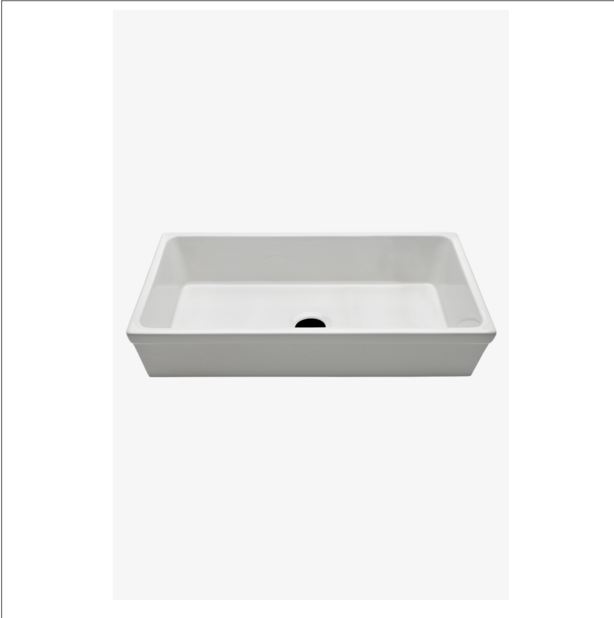
SHOWN IN CLAYBURN 35 1/2" X 19 3/4" X 10" FIRECLAY FARMHOUSE APRON KITCHEN SINK WITH CENTER DRAIN| CASK54

Clayburn 35 1/2" x 19 3/4" x 10" Fireclay Farmhouse Apron Kitchen Sink with Center Drain