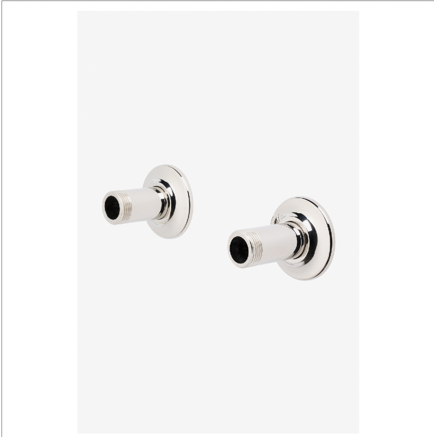
SHOWN IN EASTON PAIR OF 2 7/8" WALL UNIONS FOR EXPOSED TUB FILLERS | EAUN18

Easton Pair of 2 7/8" Wall Unions for Exposed Tub Fillers