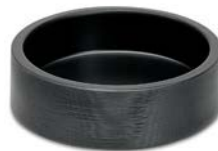
Round Soap Dish

2 7/8" x 2 7/8" x 6 3/4" GRSD01 Black 19-87782-00282 White 19-87316-60789