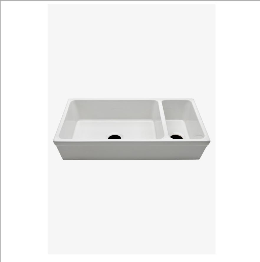
SHOWN IN CLAYBURN 35 1/2" X 19 3/4" X 10" DOUBLE FIRECLAY FARMHOUSE APRON KITCHEN SINK WITH CENTER

Clayburn 35 1/2" x 19 3/4" x 10" Double Fireclay Farmhouse Apron Kitchen Sink with Center Drains