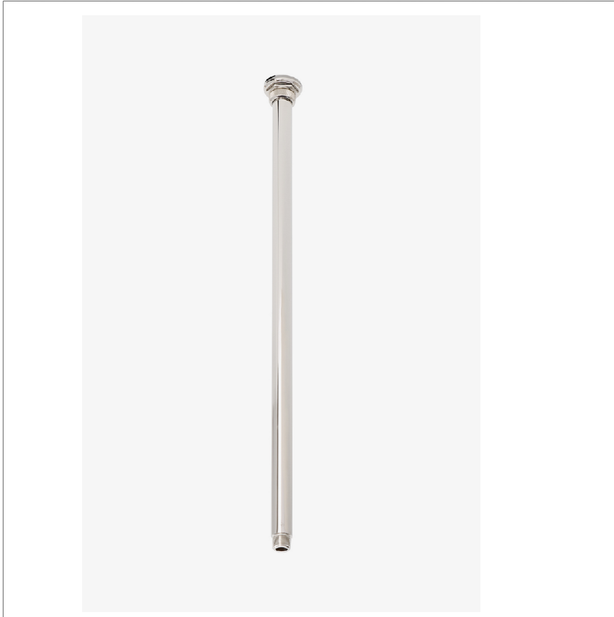
SHOWN IN R.W. ATLAS 24" CEILING MOUNTED SHOWER ARM WITH FLANGE | RWCL24

R.W. Atlas 24" Ceiling Mounted Shower Arm with Flange