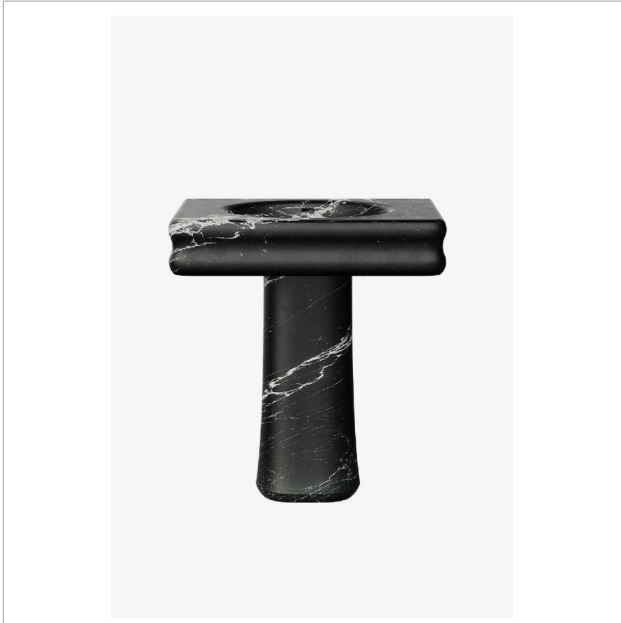
SHOWN IN CENTURIA WALL MOUNTED MARBLE LAVATORY SINK 30" X 19 1/2" X 6" AND TAPERED PEDESTAL 12" X 8 3/4" X 27" | CNCP20

Centuria Wall Mounted Marble Lavatory Sink 30" x 19 1/2" x 6" and Tapered Pedestal 12" x 8 3/4" x 27"