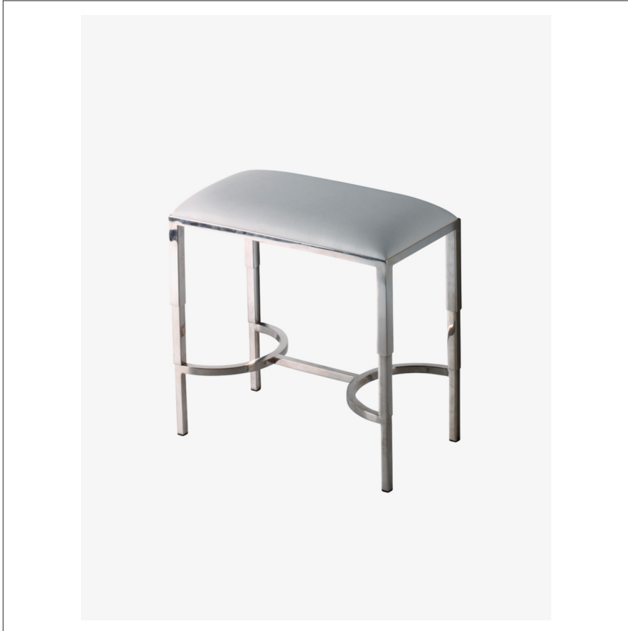
SHOWN IN EASTON METAL / VINYL RECTANGULAR STOOL 18" X 10" X 16 1/2" | EAST04

Easton Metal / Vinyl Rectangular Stool 18" x 10" x 16 1/2"