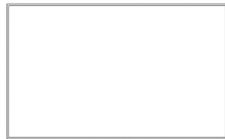
TOP VIEW SCALE: 1-1/2"=1'-0"

Easton Metal / Vinyl Rectangular Stool 18" x 10" x 16 1/2"