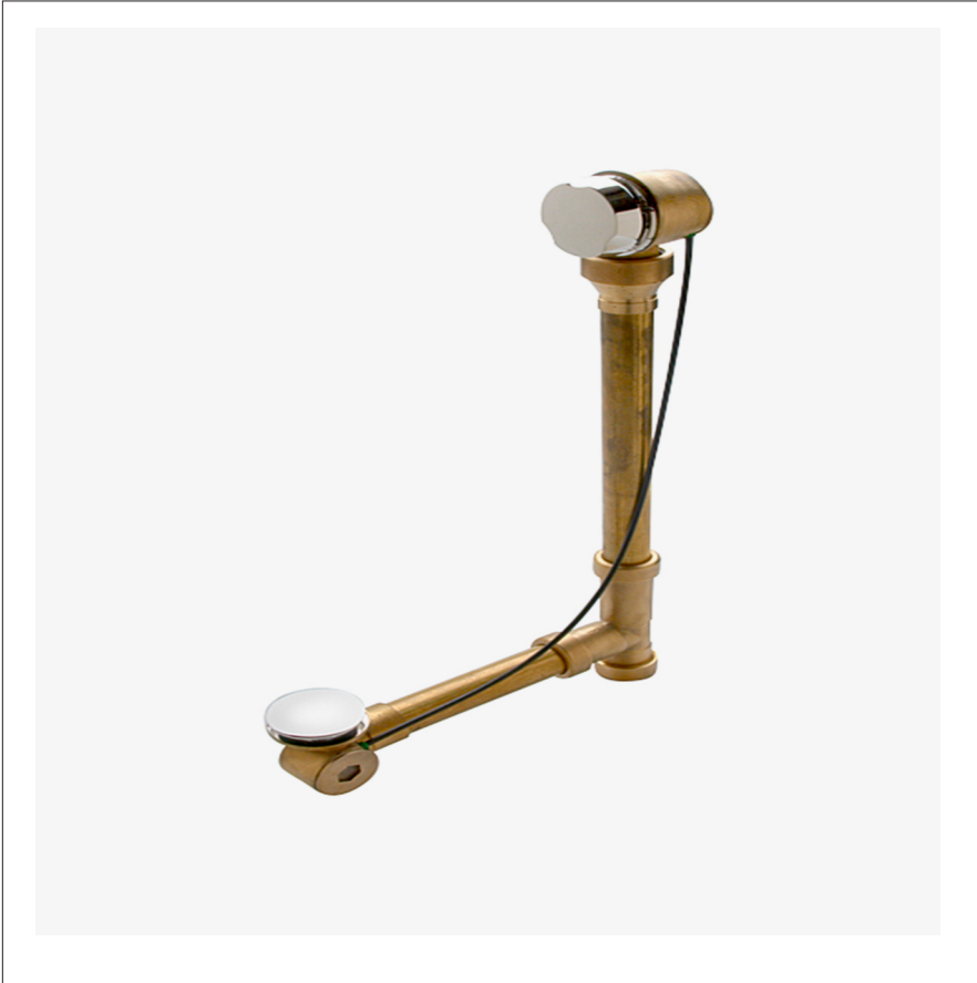
SHOWN IN UNIVERSAL POP-UP WASTE AND OVERFLOW DRAIN| UNWO51