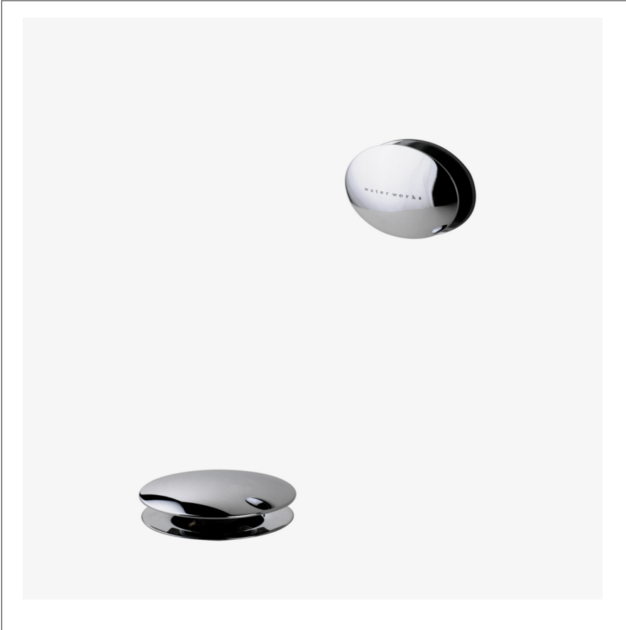
SHOWN IN .25 PUSH-TOUCH WASTE AND OVERFLOW DRAIN| PTW004