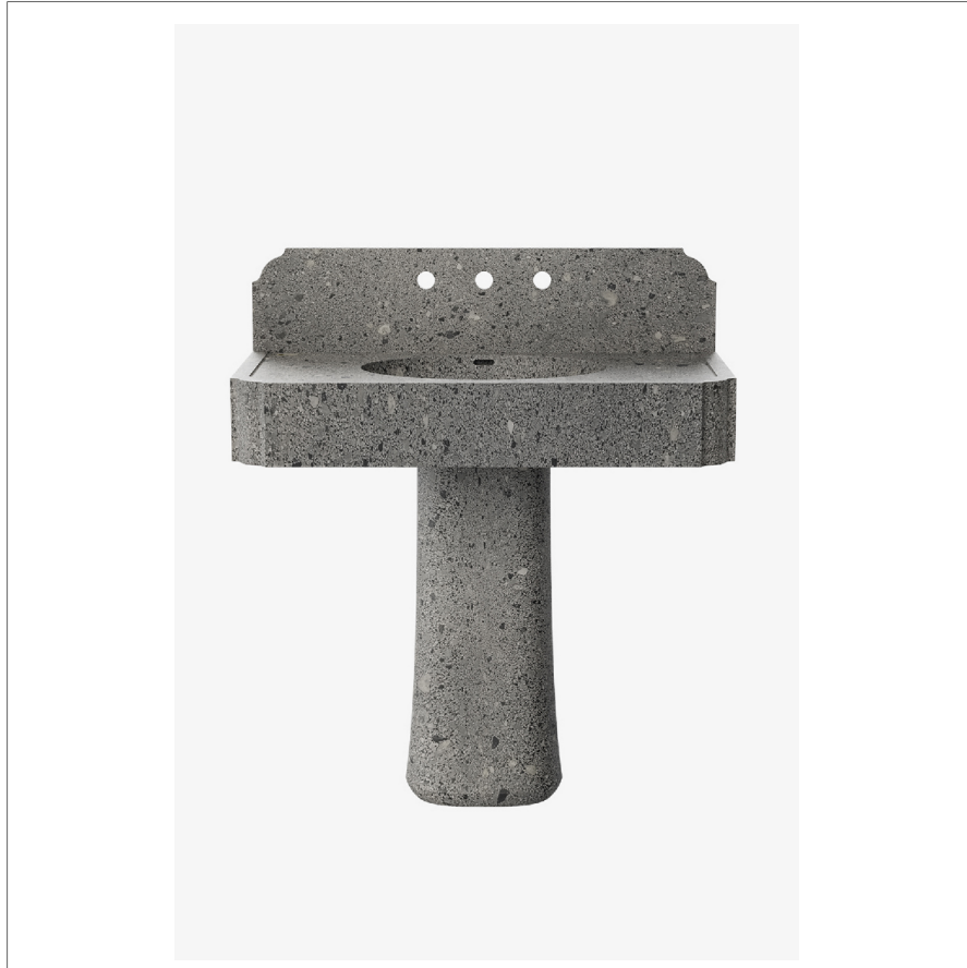
SHOWN IN AUDRA WALL MOUNTED MARBLE LAVATORY SINK 36" X 19 3/4" X 6" WITH 36" X 8" X 3/4" BACKSPLASH AND TAPERED PEDESTAL 12" X 8 3/4" X 27" | AUCP07

Audra Wall Mounted Marble Lavatory Sink 36" x 19 3/4" x 6" with 36" x 8" x 3/4" Backsplash and Tapered Pedestal 12" x 8 3/4" x 27"