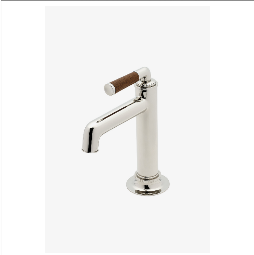
SHOWN IN HENRY CHRONOS ONE HOLE BAR FAUCET WITH WALNUT LEVER HANDLE | CKM414

Henry Chronos One Hole Bar Faucet with Walnut Lever Handle