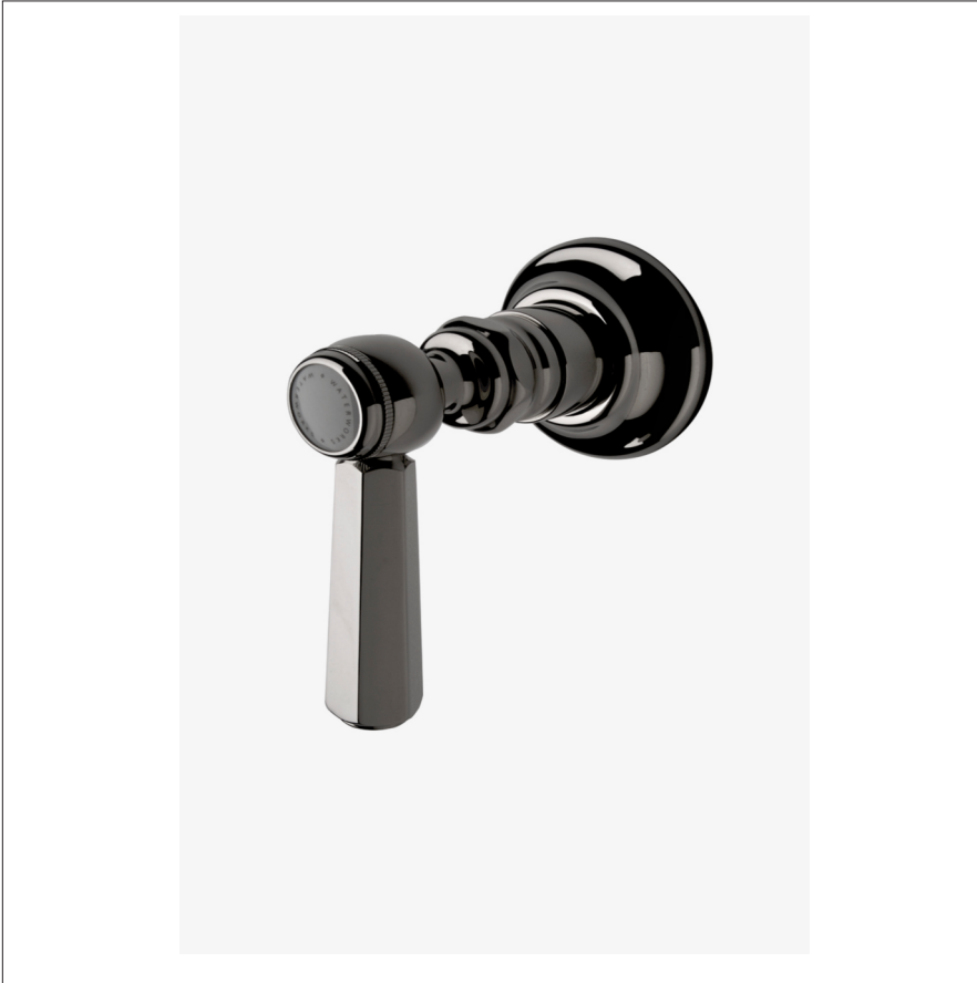
SHOWN IN ASTORIA VOLUME CONTROL VALVE TRIM WITH METAL LEVER HANDLE| ATVC47