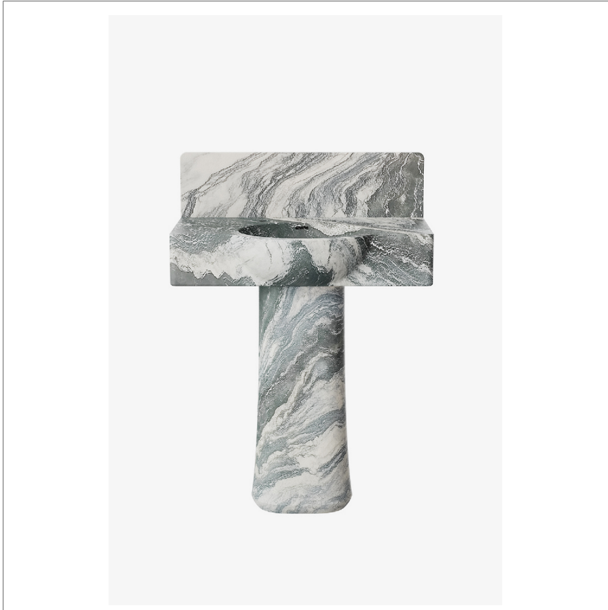
SHOWN IN DORIA DECK MOUNTED MARBLE LAVATORY SINK 30" X 21 3/4" X 6" WITH 30" X 8" X 3/4" BACKSPLASH AND TAPERED PEDESTAL 12" X 8 3/4" X 27" | DOCP18

Doria Deck Mounted Marble Lavatory Sink 30" x 21 3/4" x 6" with 30" x 8" x 3/4" Backsplash and Tapered Pedestal 12" x 8 3/4" x 27"