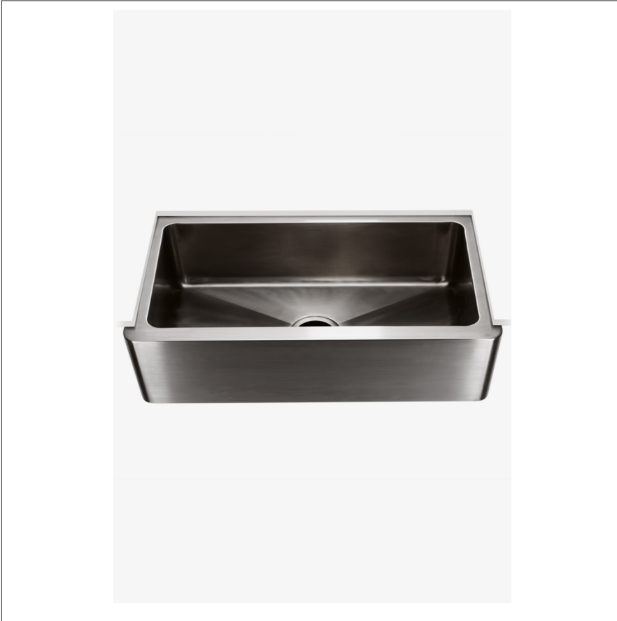
SHOWN IN KERR 30" X 18" X 10 1/8" STAINLESS STEEL FARMHOUSE APRON KITCHEN SINK WITH CENTER DRAIN| KRSK72

Kerr 30" x 18" x 10 1/8" Stainless Steel Farmhouse Apron Kitchen Sink with Center Drain