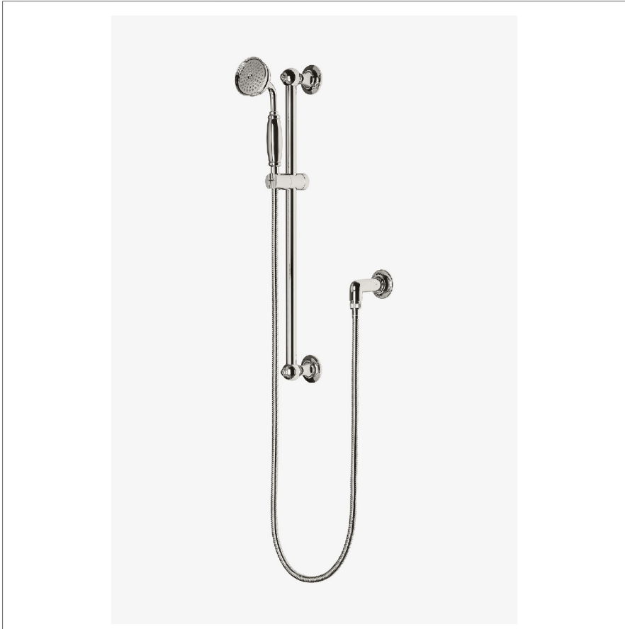
SHOWN IN EASTON CLASSIC HANDSHOWER ON BAR WITH METAL HANDLE | EAHS45

Easton Classic Handshower On Bar with Metal Handle