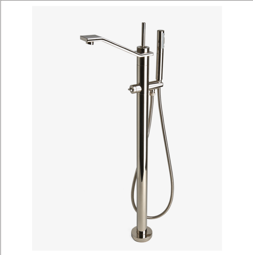
SHOWN IN FORMWORK FLOOR MOUNTED EXPOSED TUB FILLER WITH HANDSHOWER AND METAL JOYSTICK HANDLE

Formwork Floor Mounted Exposed Tub Filler with Handshower and Metal Joystick Handle