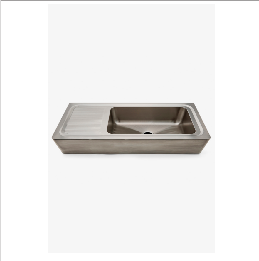
SHOWN IN KERR 48" X 21" X 10 1/4" STAINLESS STEEL FARMHOUSE APRON KITCHEN SINK WITH CENTER DRAIN AND

Kerr 48" x 21" x 10 1/4" Stainless Steel Farmhouse Apron Kitchen Sink with Center Drain and Drainboard