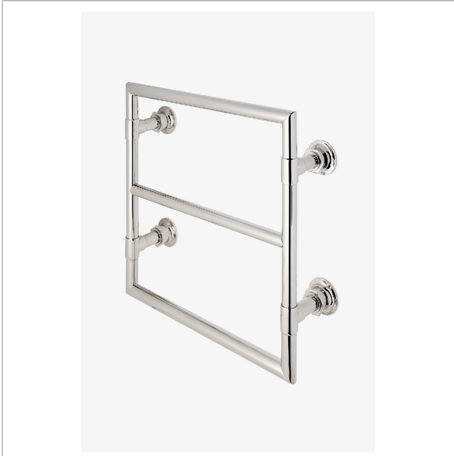
SHOWN IN HENRY 110V MULTI-RAIL TOWEL WARMER | HNTW03