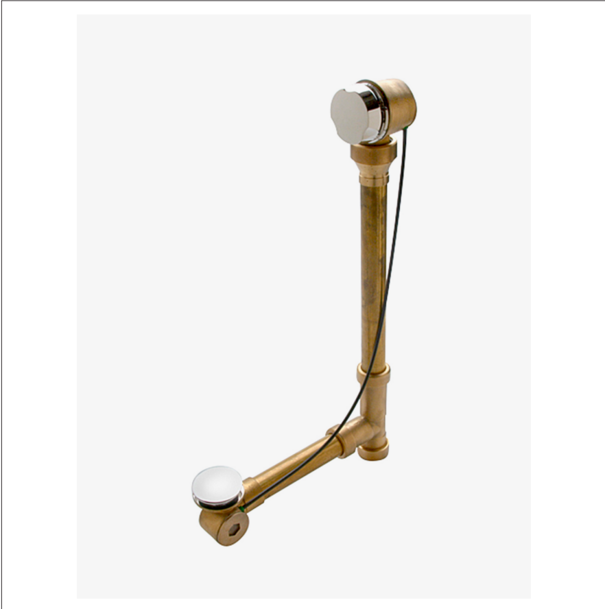
SHOWN IN UNIVERSAL POP-UP WASTE AND OVERFLOW DRAIN| UNWO51