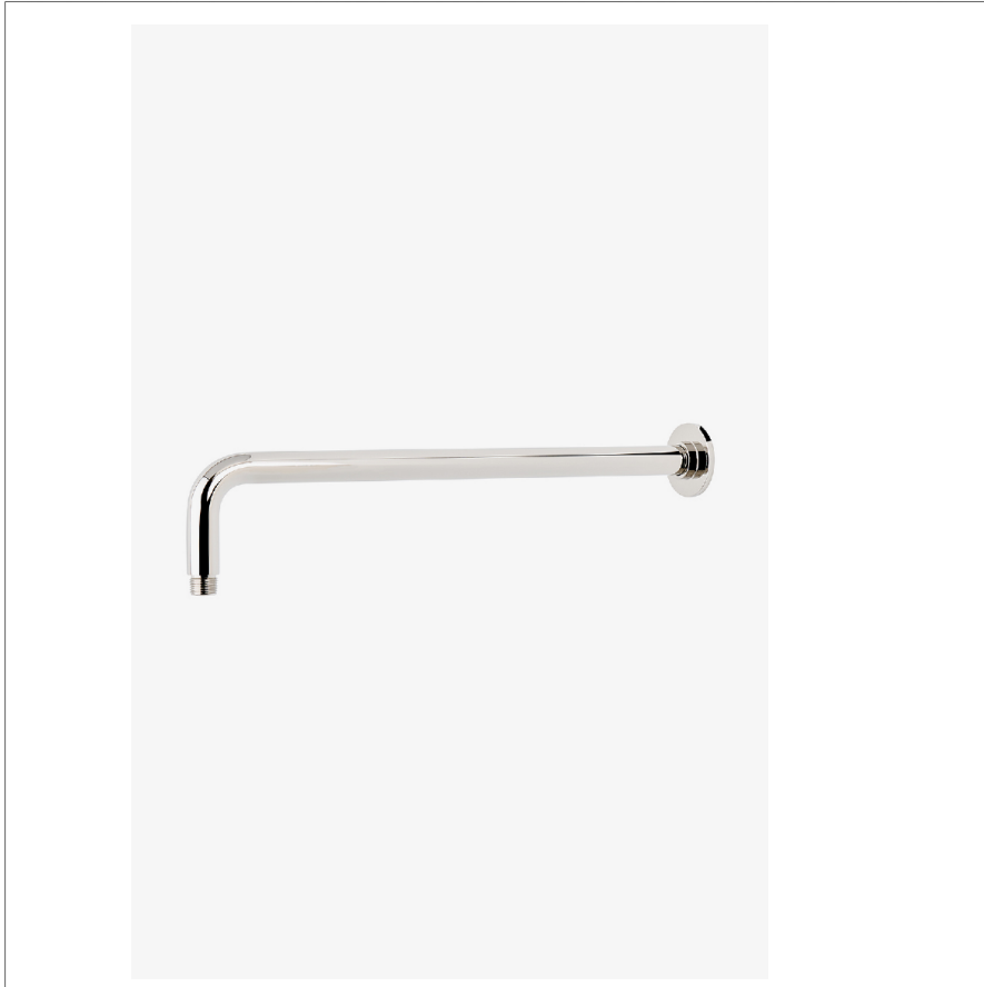
SHOWN IN UNIVERSAL MODERN 18" WALL MOUNTED 90 DEGREE SHOWER ARM WITH FLANGE | UMWL18

Universal Modern 18" Wall Mounted 90 Degree Shower Arm with Flange