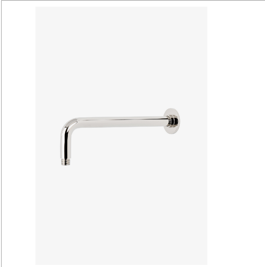
SHOWN IN UNIVERSAL MODERN 12" WALL MOUNTED 90 DEGREE SHOWER ARM WITH FLANGE | UMWL12

Universal Modern 12" Wall Mounted 90 Degree Shower Arm with Flange