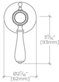
FRONT VIEW SCALE: 3"=1'-0"