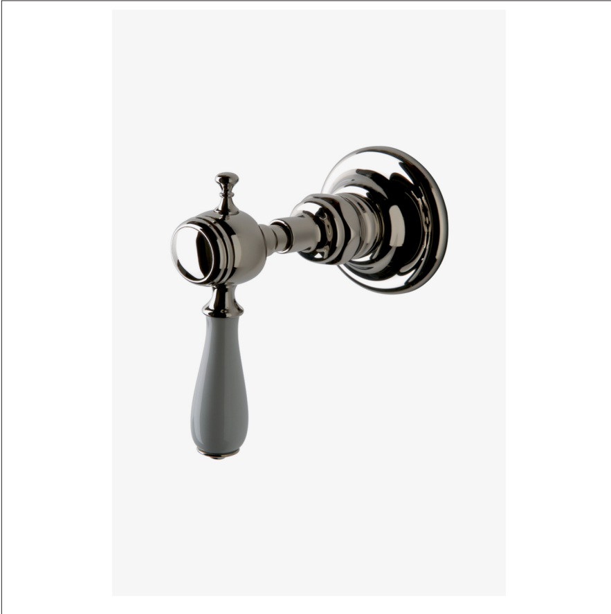
SHOWN IN JULIA VOLUME CONTROL VALVE TRIM WITH WHITE PORCELAIN LEVER HANDLE | JUVC51