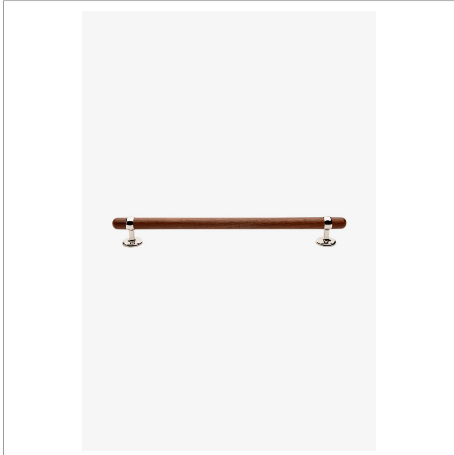
SHOWN IN STOCKTON 12" WALNUT PULL | SKHW12