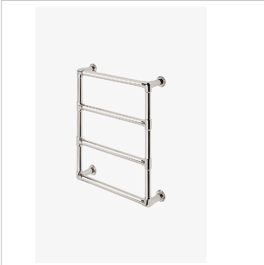
SHOWN IN ESSENTIALS TRANSITIONAL 230V MULTI-RAIL TOWEL WARMER | E304TW

Essentials Transitional 230v Multi-Rail Towel Warmer