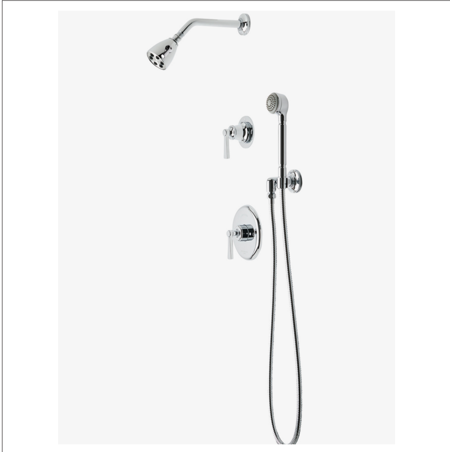
SHOWN IN TRANSIT PRESSURE BALANCE SHOWER PACKAGE WITH 2 3/4" HEAD, HANDSHOWER AND DIVERTER LEVER

Transit Pressure Balance Shower Package with 2 3/4" Head, Handshower and Diverter Lever Handle