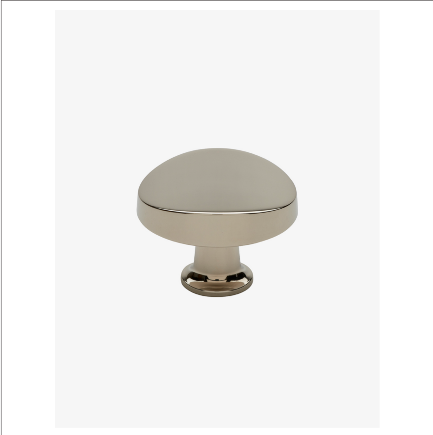
SHOWN IN DUNE 1 1/2" KNOB| DUHW02