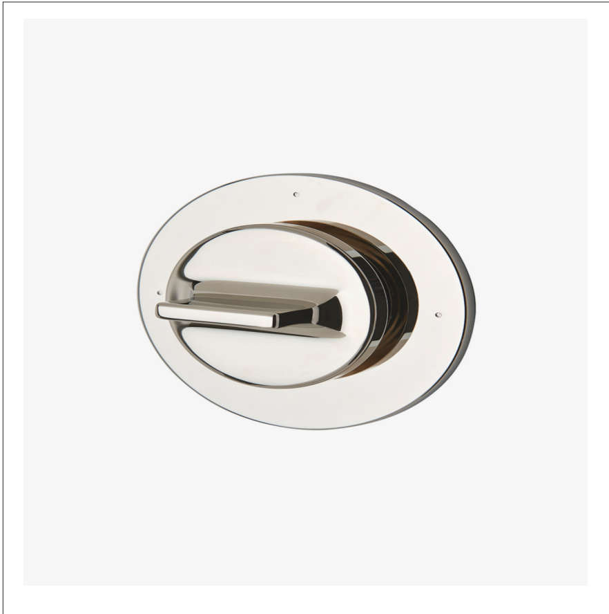
SHOWN IN FORMWORK THREE WAY DIVERTER VALVE TRIM FOR PRESSURE BALANCE SYSTEM WITH METAL KNOB HANDLE

Formwork Three Way Diverter Valve Trim for Pressure Balance System with Metal Knob Handle