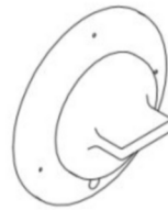
ISO VIEW SCALE: 3"=1'-0"