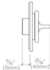
SIDE VIEW SCALE: 3"=1'-0"