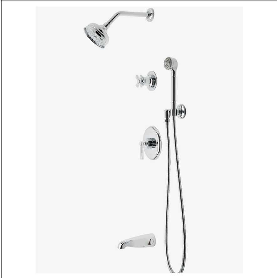
SHOWN IN TRANSIT PRESSURE BALANCE SHOWER PACKAGE WITH 5" SHOWER ROSE, HANDSHOWER, TUB SPOUT AND

Transit Pressure Balance Shower Package with 5" Shower Rose, Handshower, Tub Spout and Diverter Cross Handle