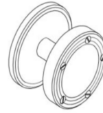
ISO VIEW SCALE: 6"=1'-0"