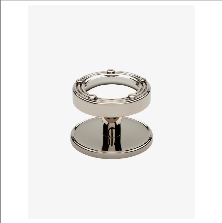
SHOWN IN GRIMSBY 1 1/2" KNOB | GMHW02