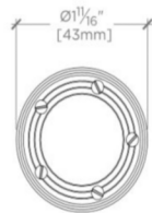
FRONT VIEW SCALE: 6"=1'-0"