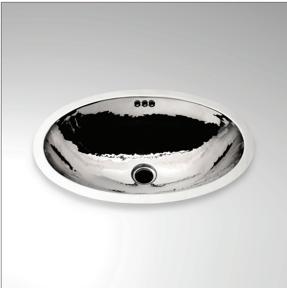
SHOWN IN finish/color

Suitable for master baths and powder rooms.