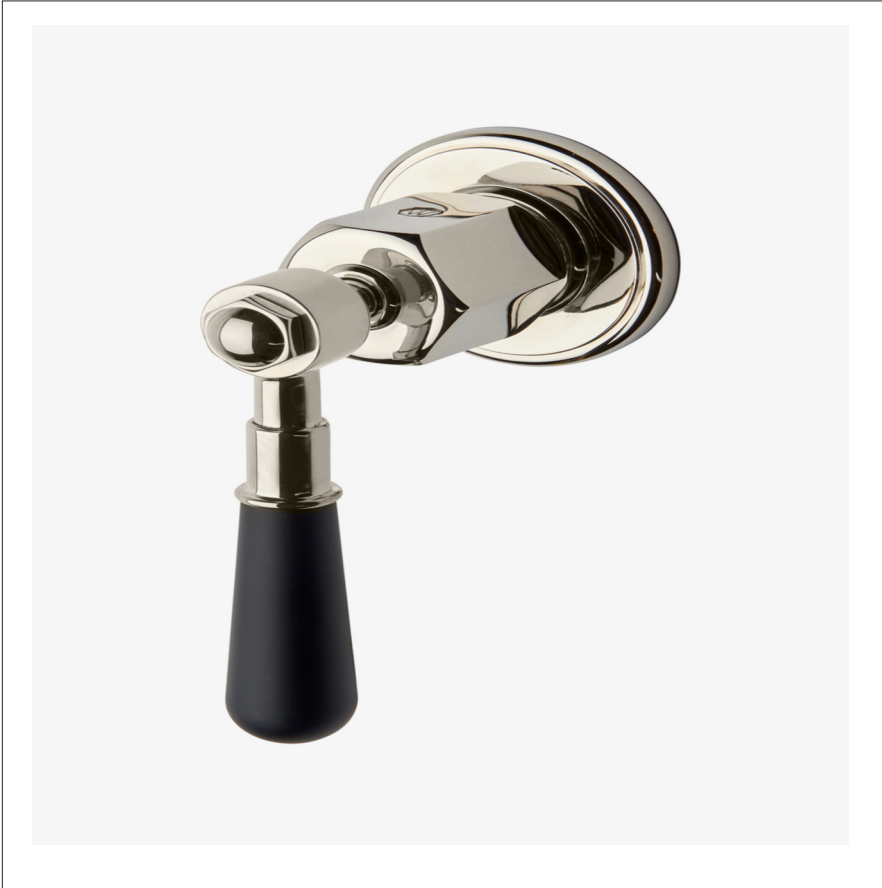
SHOWN IN REGULATOR VOLUME CONTROL VALVE TRIM WITH BLACK LEVER HANDLE| RGVC10

Regulator Volume Control Valve Trim with Black Lever Handle