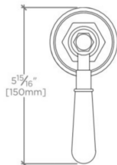
FRONT VIEW SCALE: 3"=1'-0"