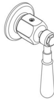
ISO VIEW SCALE: 3"=1'-0"