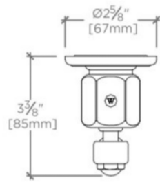
TOP VIEW SCALE: 3"=1'-0"

Regulator Volume Control Valve Trim with Black Lever Handle