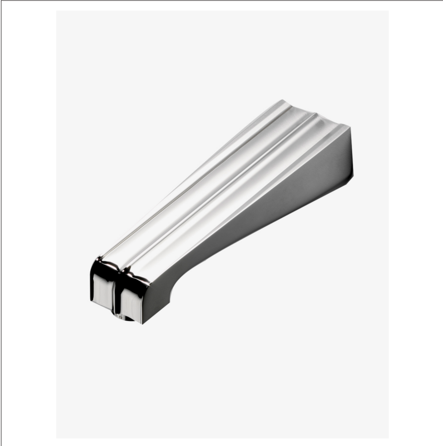
SHOWN IN BOULEVARD WALL MOUNTED TUB SPOUT | BDTS82