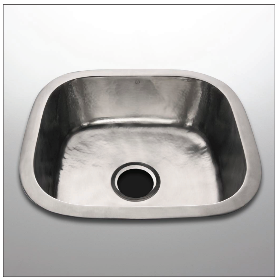
SHOWN IN Matte Nickel

Suitable for kitchen and bar applications.