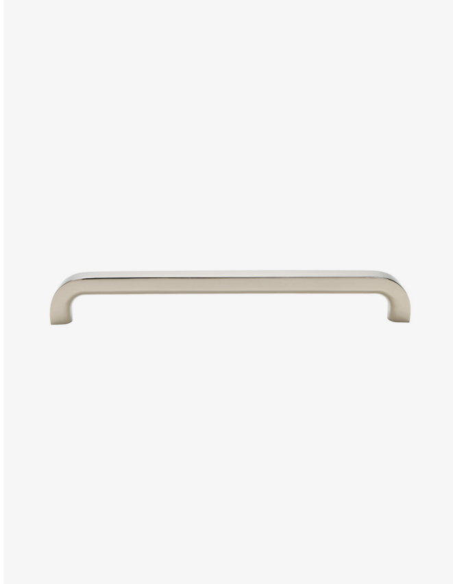
SHOWN IN DILLON 12" PULL | DNHW12