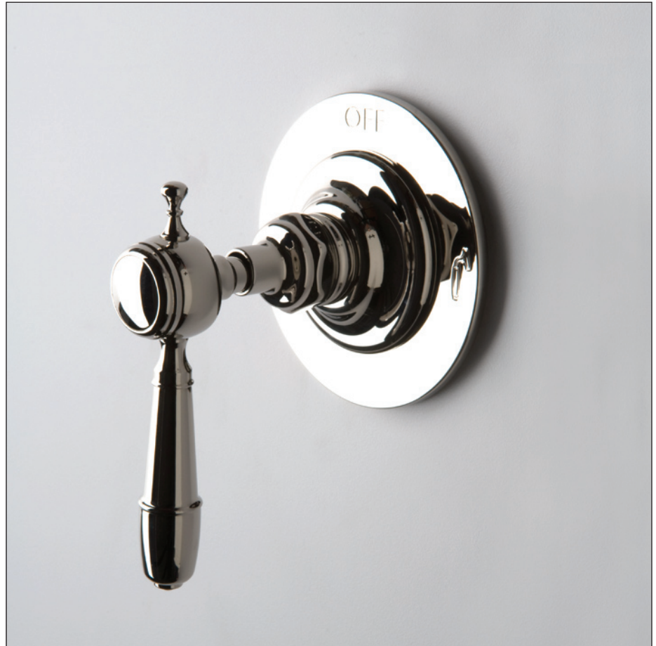
SHOWN IN Nickel

Brass material used for all trim and valve component parts.