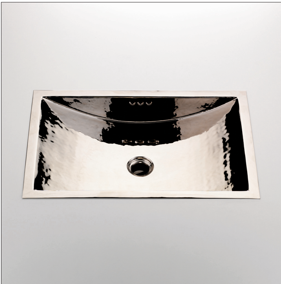
SHOWN IN Nickel

Suitable for master baths and powder rooms.