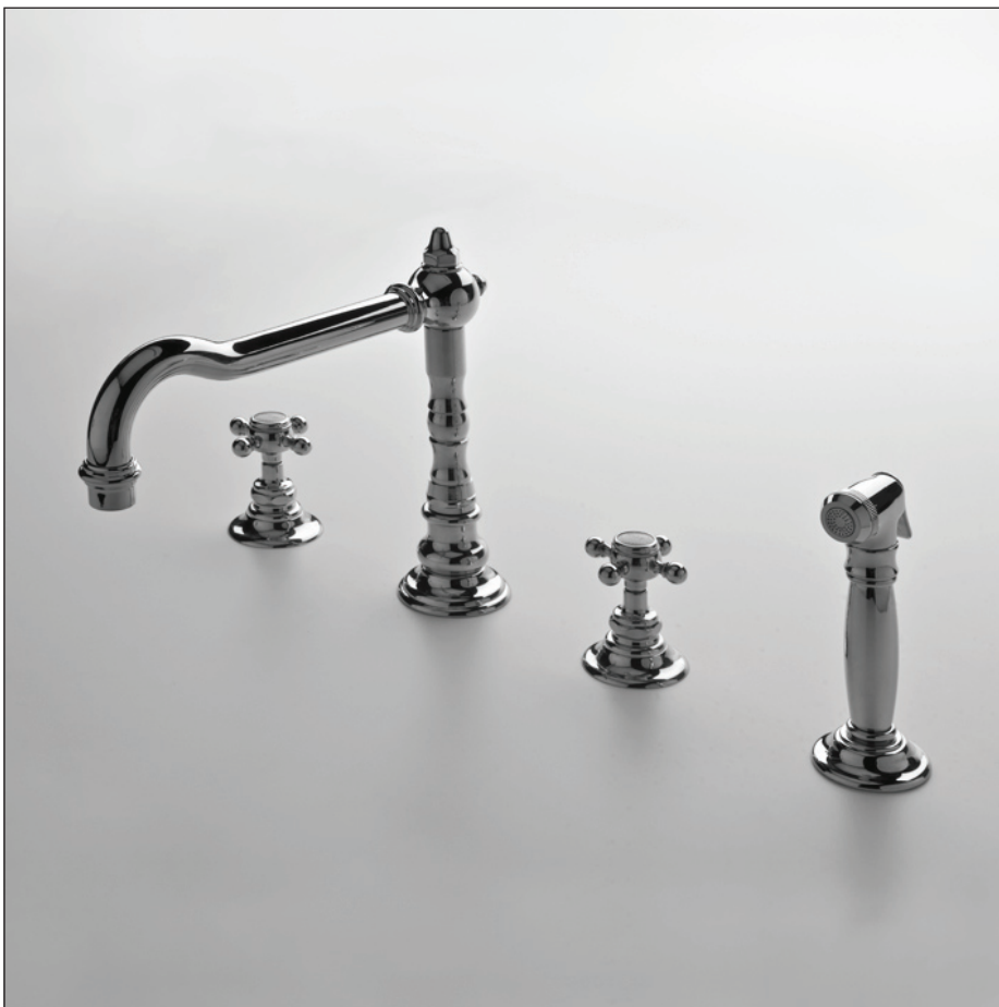
SHOWN IN Nickel

Available option that complies with 0.25% Weighted Average Lead Content (WALC).