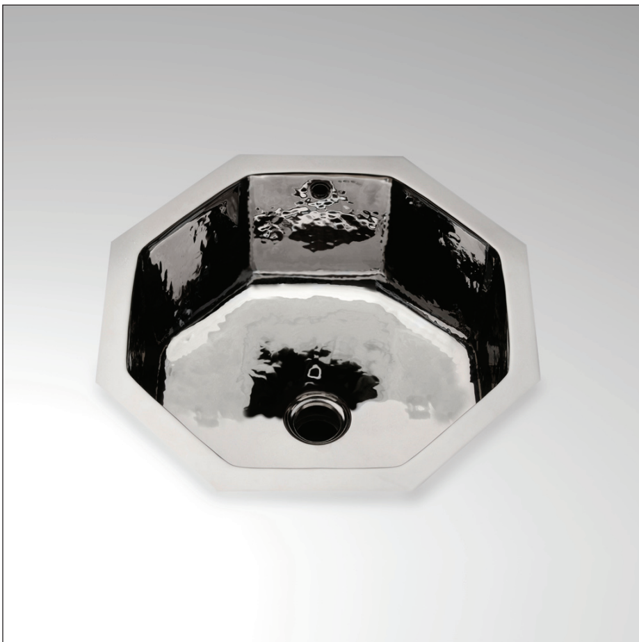
SHOWN IN finish/color

Suitable for master baths and powder rooms.