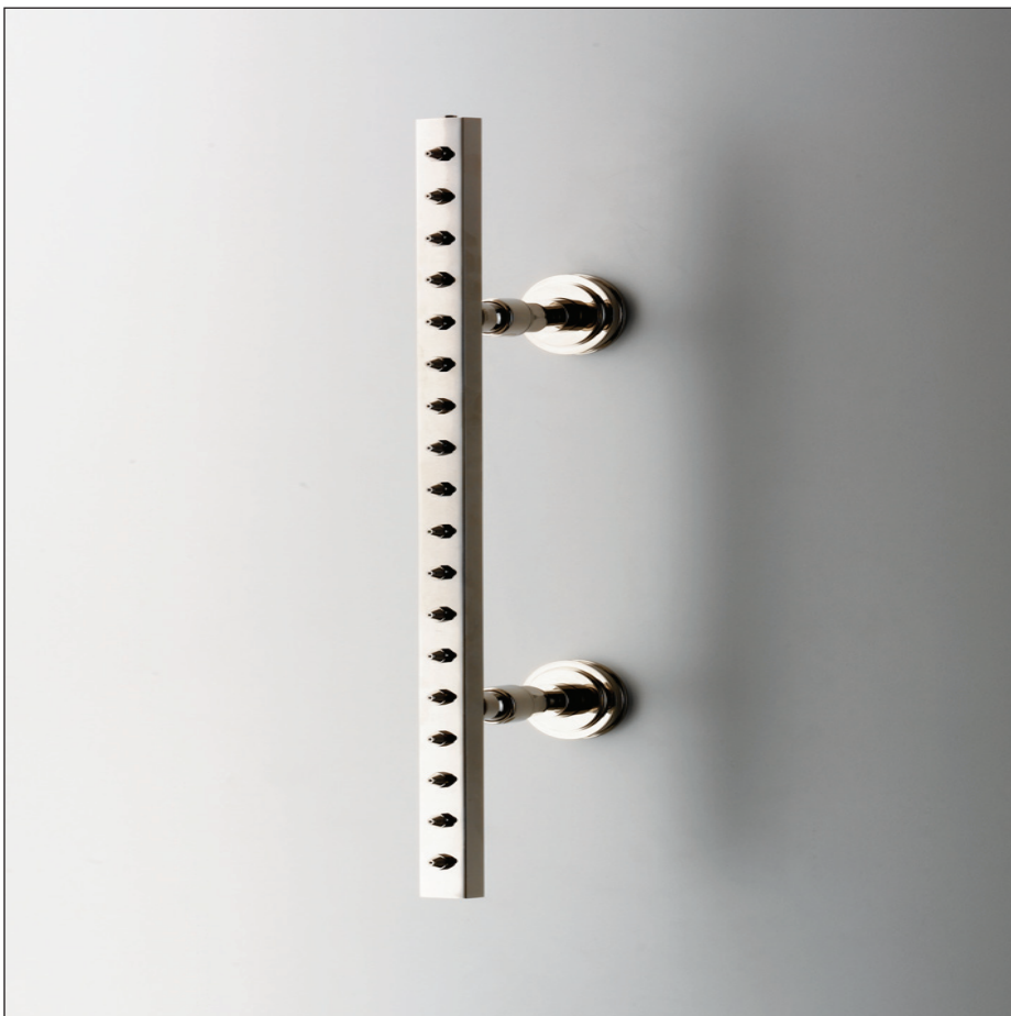
SHOWN IN Nickel