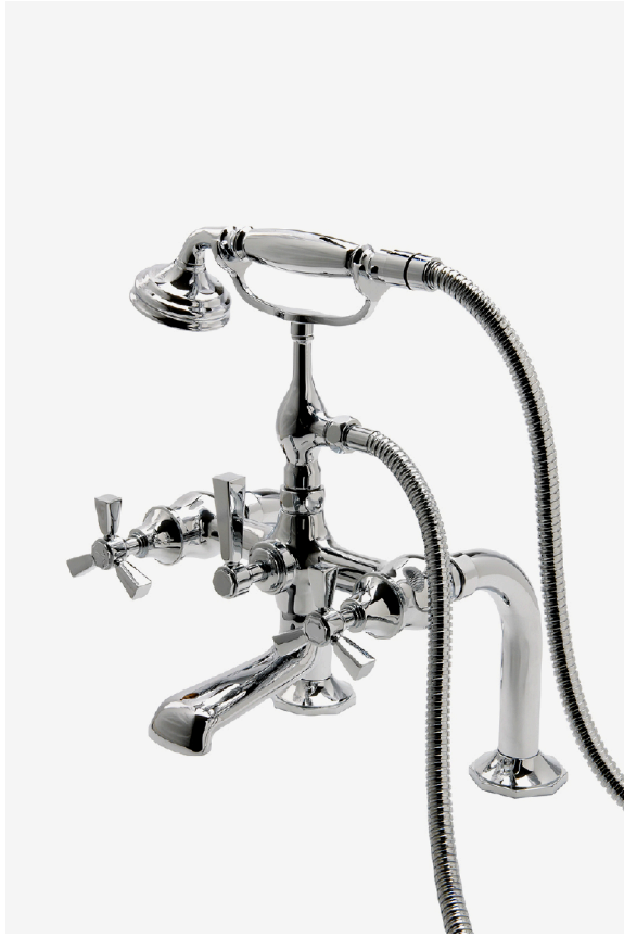
SHOWN IN ROADSTER EXPOSED DECK MOUNTED TUB FILLER WITH HANDSHOWER AND TRI-SPOKE HANDLES | RDXT40

Roadster Exposed Deck Mounted Tub Filler With Handshower and Tri-spoke Handles