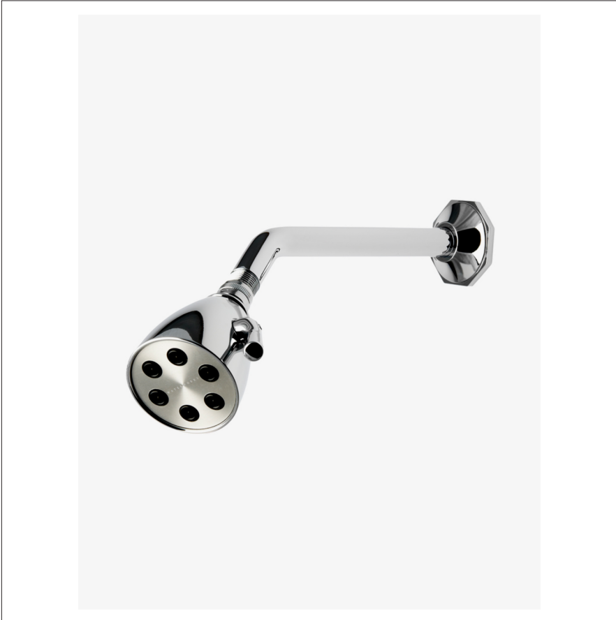
SHOWN IN UNIVERSAL 2 3/4" SHOWER HEAD WITH ADJUSTABLE SPRAY| UNSH38