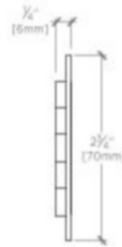
SIDE VIEW SCALE: 6"=1'-0"