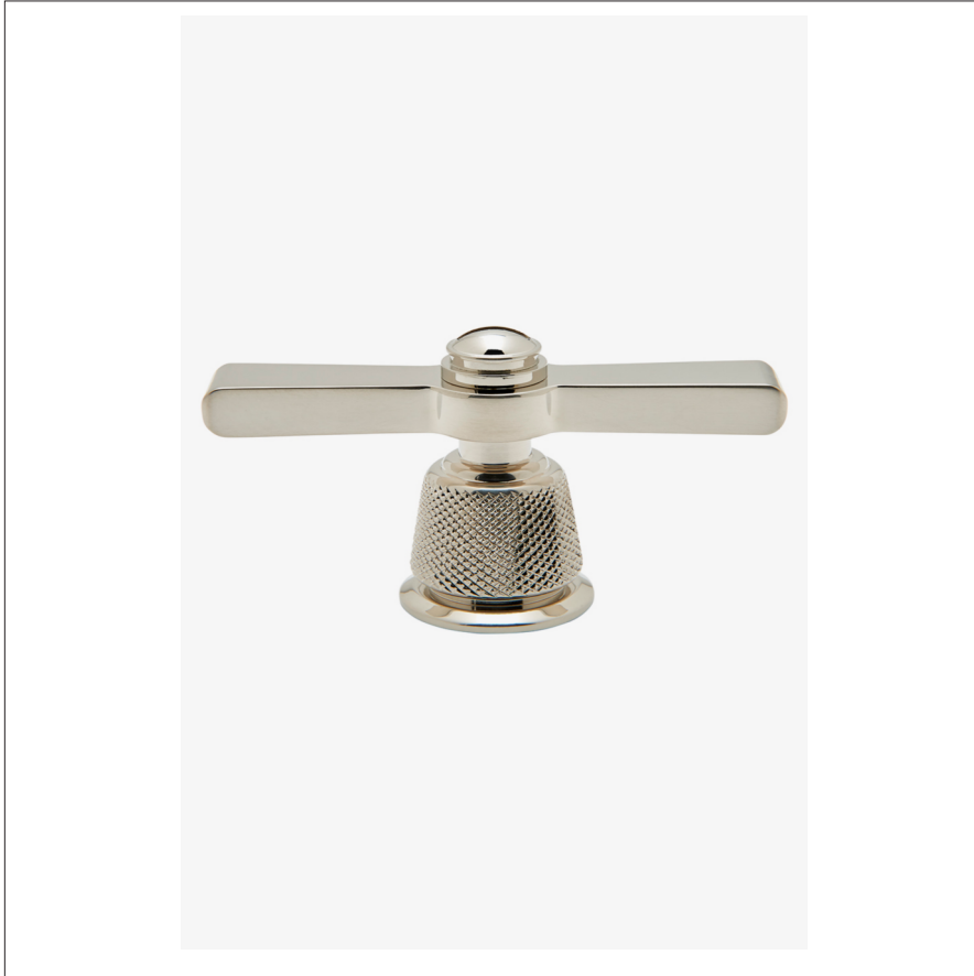
SHOWN IN R.W. ATLAS 3 1/4" WING HANDLE PULL | RWHW08