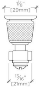
TOP VIEW SCALE: 6"=1'-0"