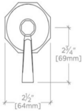
FRONT VIEW SCALE: 3"=1'-0"