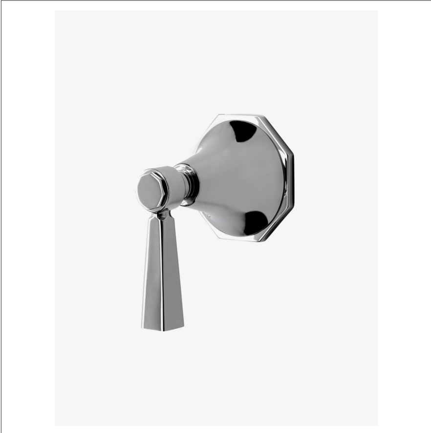
SHOWN IN ROADSTER VOLUME CONTROL VALVE TRIM WITH METAL LEVER HANDLE | RDVC50

Roadster Volume Control Valve Trim with Metal Lever Handle