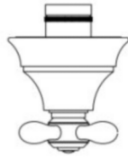
TOP VIEW SCALE: 3"=1'-0"

Aero Retro Volume Control Valve Trim with Metal Cross Handle