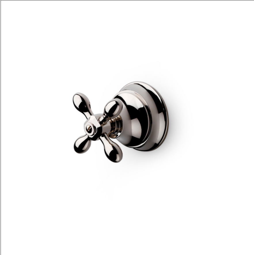
SHOWN IN NICKEL WITH CROSS HANDLE