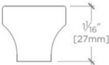
FRONT VIEW SCALE: 6"=1'-0"