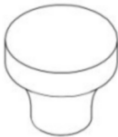
ISO VIEW SCALE: 6"=1'-0"