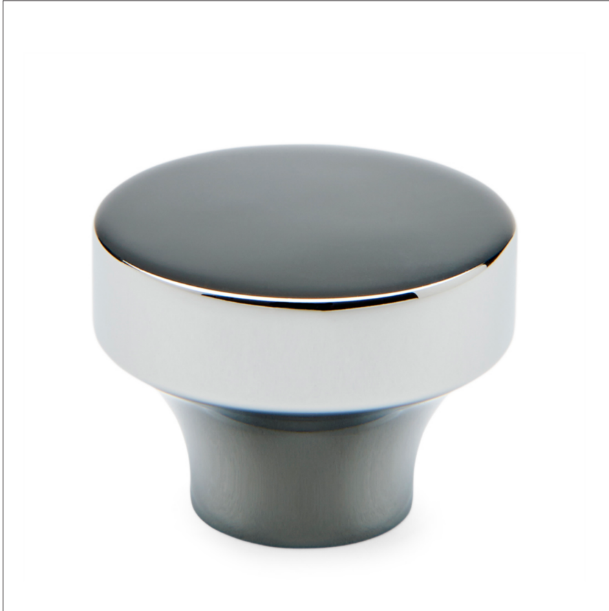
SHOWN IN CHROME