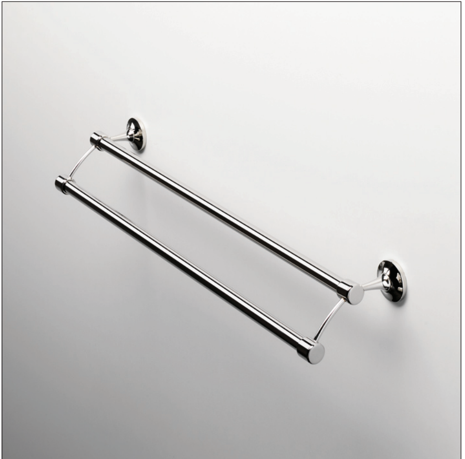
SHOWN IN Nickel